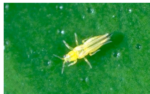
Fig 1. Frankliniella occidentalis also named Western flower thrip, is a very important pest in agriculture as it feeds on over a wide range of different species of host plants, including a large number of fruit, vegetable, and ornamental crops. The insect damages the plant in several ways being the major cause by ovipositing in the plant tissue. The plant is also injured by feeding, which leaves holes and areas of silvery discoloration when the plant reacts to the insect's saliva. Nymphs feed heavily on new fruit just beginning to develop from the flower. The western flower thrip is also the major vector of tomato spotted wilt virus, a serious plant disease.