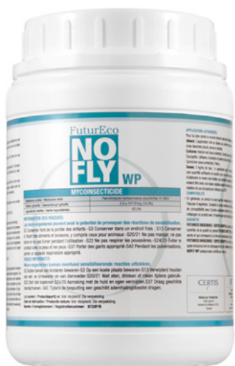
Fig 2. Commercial product NOFLY WP