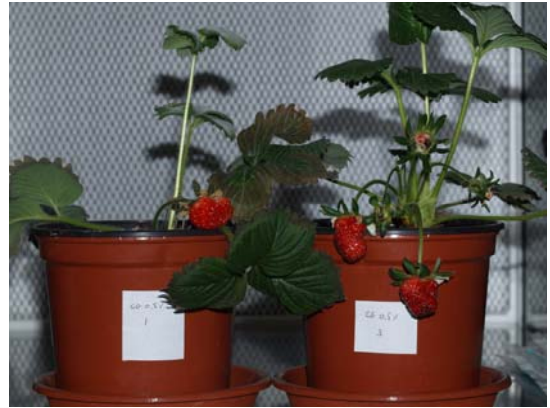
Figure 2. Strawberry plants treated with CITOGROWER®

Organoleptic properties were also assessed and resulted in better colour and more intense odour in fruits from treated plants with CITOGROWER®. Furthermore, no abnormalities were seen in plants treated with the product.